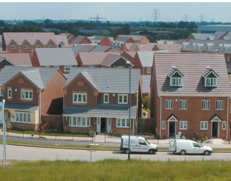
▲ The old landfill site is in the foreground and the road occupies the reduced non-development barrier zone.